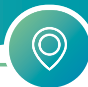
MEMBERSHIP LOCATION BY REGION